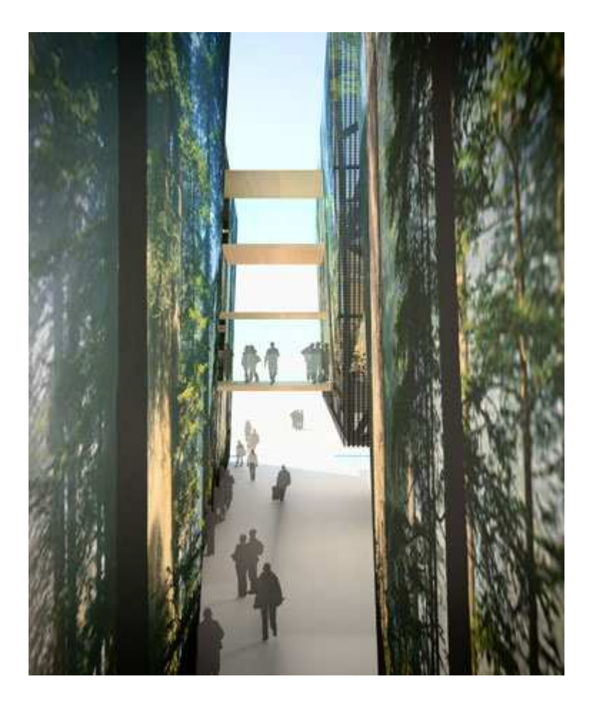
artistic rendition of Sweden Pavilion