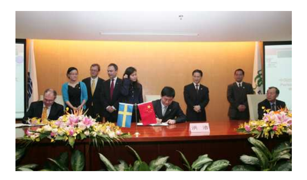
scene of the signing ceremony