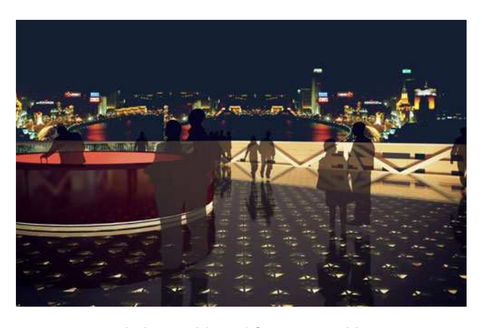
artistic rendition of Sweden Pavilion