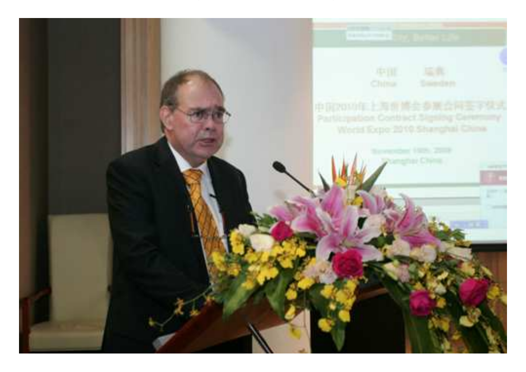
Hans Jeppson, Sweden's Acting Commissioner General for the Expo

The country signed a participation contract with Expo organiser today, and revealed that its pavilion would be a large square that is divided into four blocks by a crossroad in the center to comprise the image of its national flag.