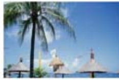
The natural landscapes