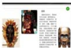
The arts of totem