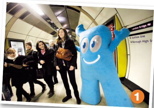
1. Haibao greets passengers in London's subway as part of Shanghai Week activities.