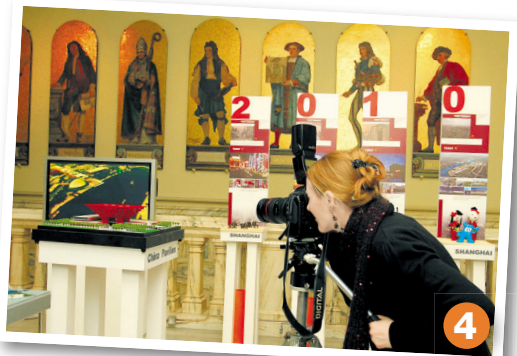
4. A photographer takes pictures of the model China Pavilion for Expo 2010 at the "From London to Shanghai" exhibition.