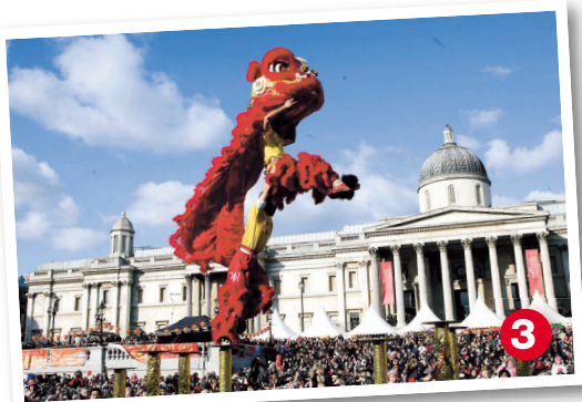
3. A lion dance celebrates the Chinese New Year in central London's Trafalgar Square.