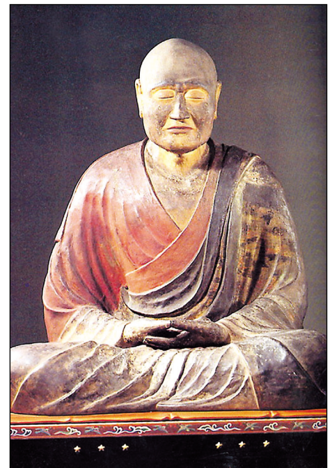
Jianzhen's statue is a clay impression made from his body shortly after his death in AD 763. It is now enshrined in the Toshodai Temple in Nara, Japan.