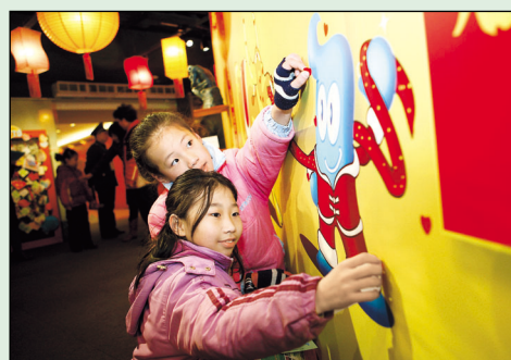
Two young visitors stick "Chinese hearts" to Haibao, the mascot of Expo Shanghai 2010, at the Expo Exhibition Centre on Huaihai Road during the Spring Festival.

The EU is the 231st participant in the Expo 2010.