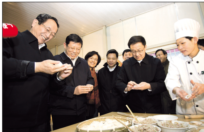
Yu Zhengsheng (left) and Han Zheng (2nd on the right) make dumplings in a canteen at the Expo Site.

They also visited a canteen and made dumplings for the workers.