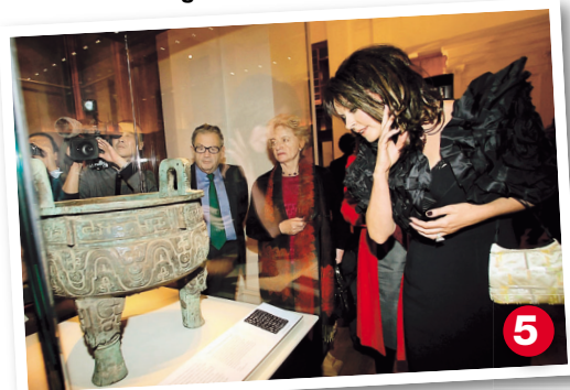
5. Sarah Brightman, Expo Shanghai's promotion ambassador in the UK, visits the "Treasures from Shanghai" exhibition.