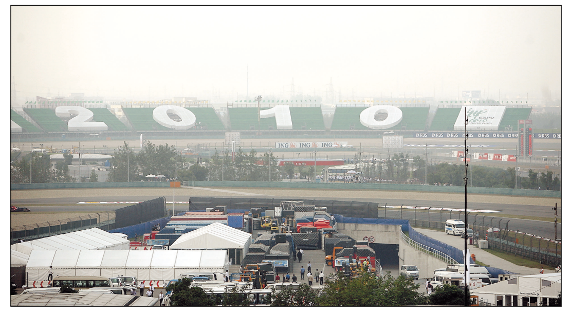
The giant logo of World Expo 2010 Shanghai China is seen on the stands of Shanghai International Circuit, the Formule One China Grand Prix since 2004.

When they're not watching the race, spectators can watch a film taking them on a virtual journey through the Expo site.