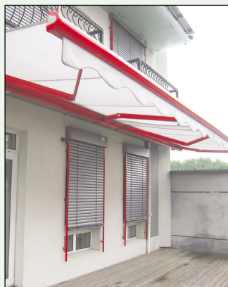
Clockwise from top left: The original "Green House;" street lamps using solar and wind power; geothermal heating for moderate indoor temperature; a central control panel; curtains with automatic control.