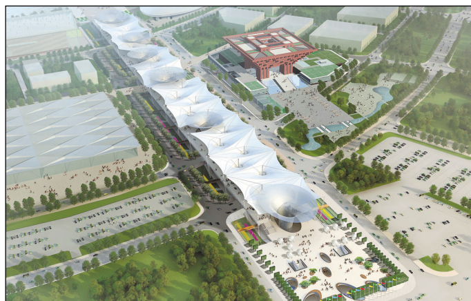
Above: one of the six 'Sunny valley' along the Expo Boulevard. Left: the bird's eye view of the Expo Boulevard.

meters of the Expo sites from 8am to 7pm, according to a traffic control plan drafted by Tongji University's School of Transportation Engineering.