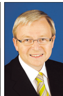
Above: Australian Prime Minister Kevin Rudd.