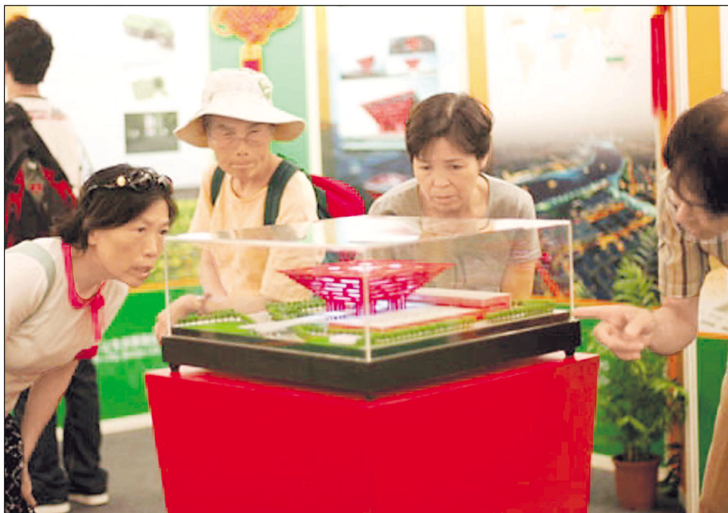
Taiwan visitors check a model of the China Pavilion at an Expo exhibition held in Taipei.

The Expo exhibition was reported by nearly 60 media outlets. CtiTV, a major local TV channel, aired a one-hour special program about the opportunities and changes the Expo would create in Shanghai. Major Taiwan newspapers also gave big coverage on the 2010 event.